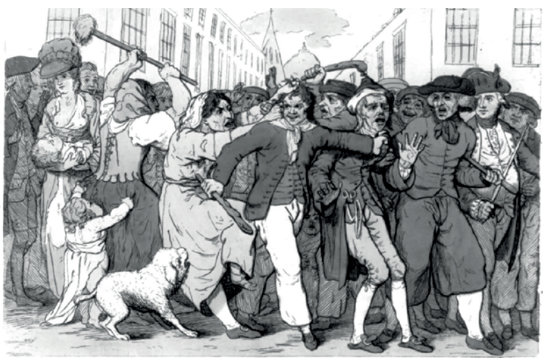
An angry mob takes a stand against impressment during the unruly 1700s.

extraordinary, encompassing more than eighty separate cases of conspiracy, revolt, mutiny, and arson—a figure probably six or seven times greater than the number of similar events that occurred in either the dozen years before 1730 or the dozen after 1742."