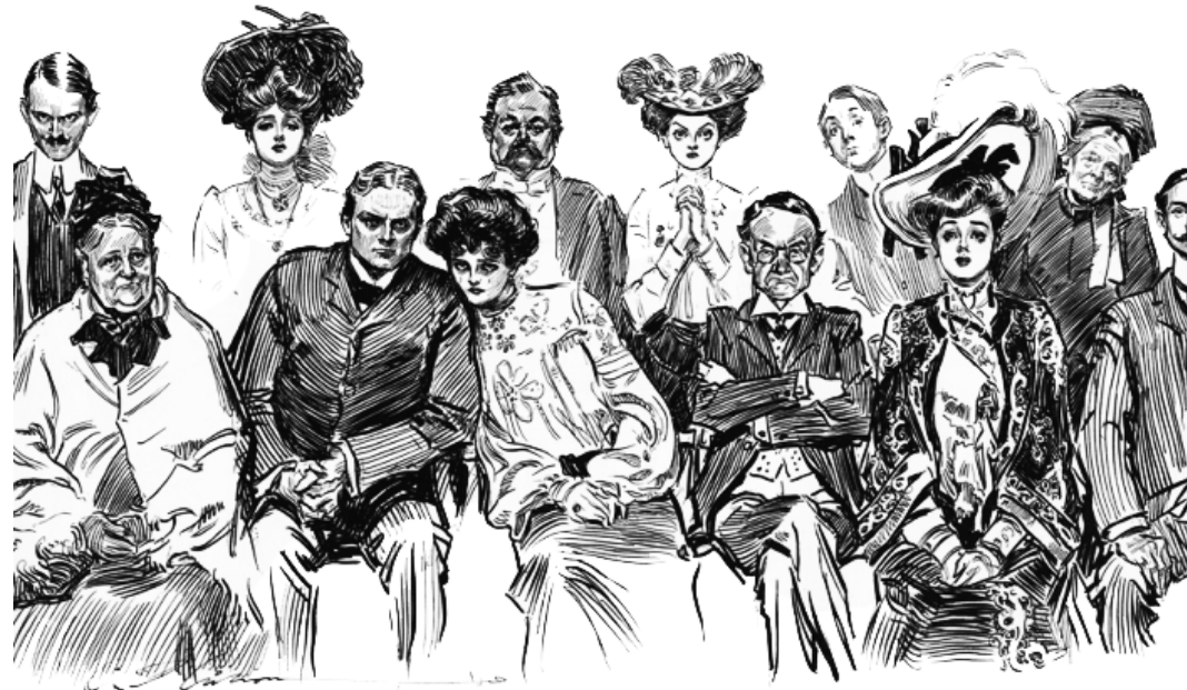
A jury of your peers

I see how I needed every moment of that build up, all of the reinforcement of self that I put into the previous ten years to get me through the experience intact. When the focus of the radical left had moved on to the next crisis, when I hadn't seen my dearest friends in years, when I was puking blood from a mysterious illness with no way to see a doctor, when I didn't even have my own name to give coherence to my words, what I did have to hold onto was the promise I had made to myself—and implicitly to all others engaged in struggle—that I would put everything I had into the fight. Prolonged psychological dissonance can really disorient, subjecting what seems like our strongest foundations to deterioration. Anarchy became the one place to which I could