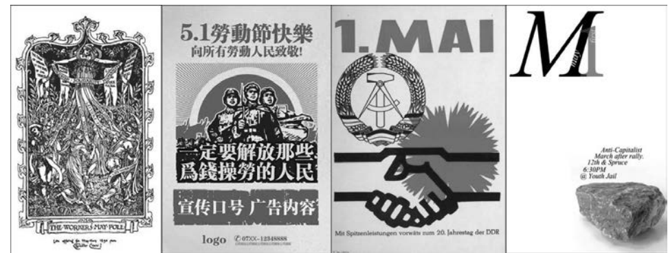
A few posters illustrating diverse ideologies competing to define the meaning of May Day.

On May 1, over 50,000 people attended an anti-war concert in Washington, DC organized in coordination with the May Day Tribe, a radical left formation including Yippie, gay, and feminist contingents. The