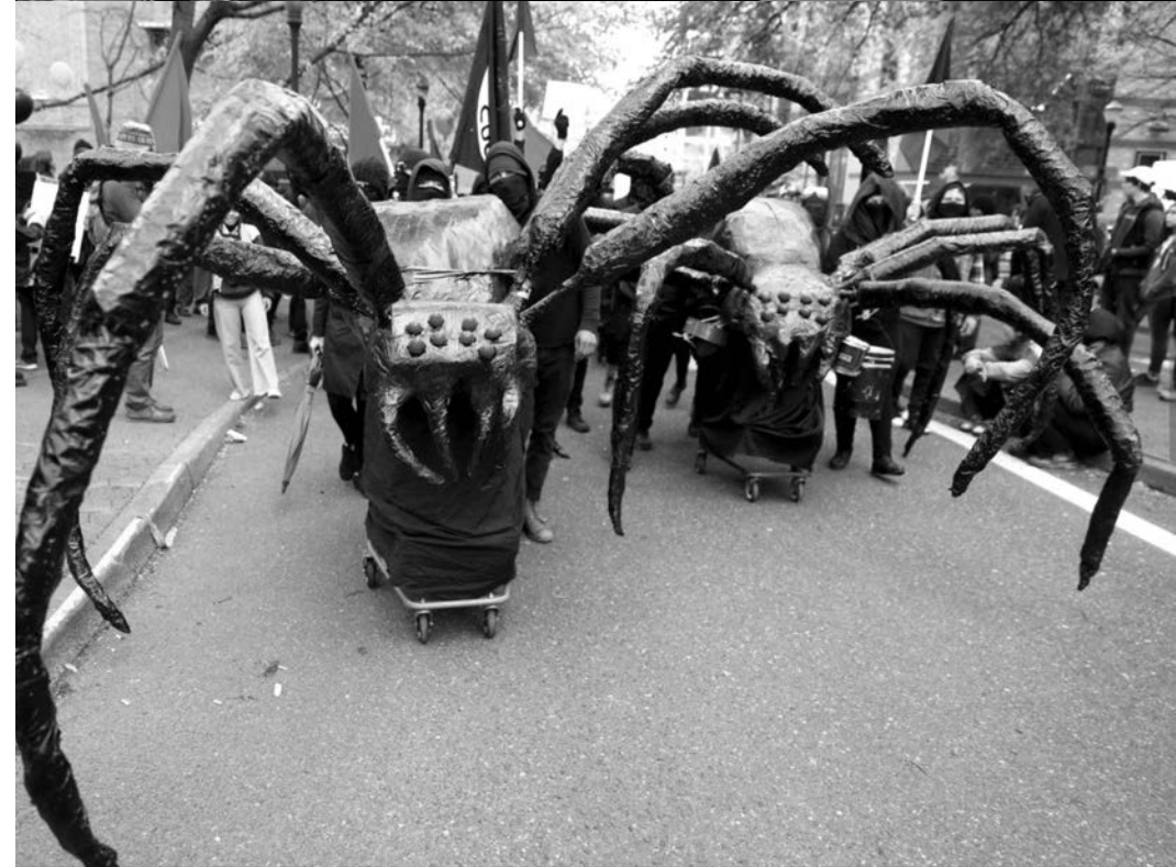
Top : A parade float designed to carry projectiles and protect demonstrators from police violence in Paris on May Day 2019.