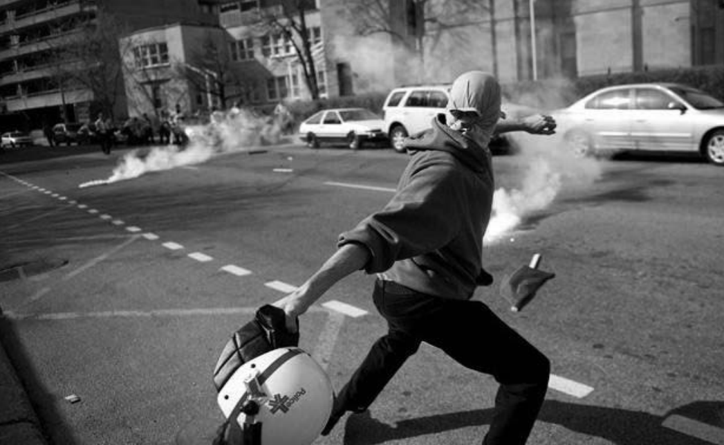
May 1, 2011 in Montréal.

off. It turned out that it was more effective for the government to organize their own tightly-regulated May Day festivities than to simply attempt to crush the demonstrations by brute force. It's instructive to take a close look at their strategy.