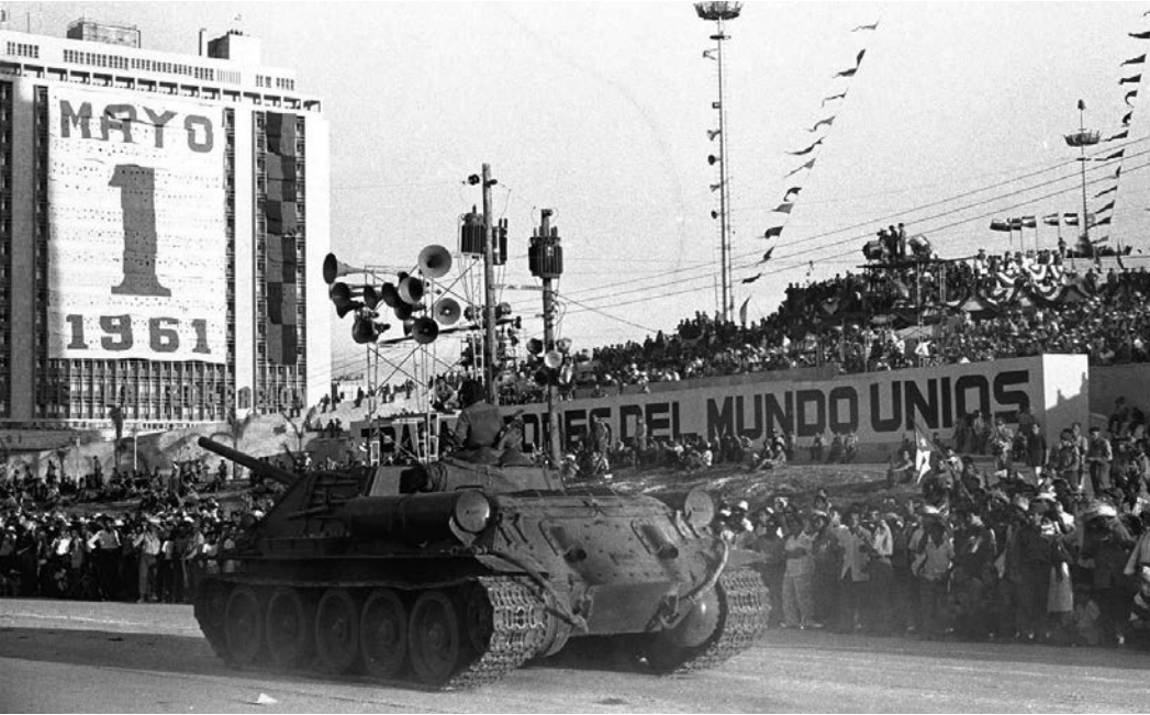
May Day in Havana, Cuba in 1961: the statist cooption of a grassroots holiday.

In Catalonia, between May 3 and 8, in what came to be known as the May Days, clashes erupted in Barcelona between anarchists and other grassroots participants in the Spanish revolution, on one side, and on the