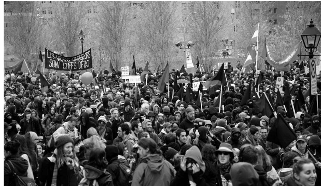
A portion of the crowd assembled for May Day in Montréal.

On May Day 2018, drawing on momentum from the movement against the Loi Travail and the defense of la ZAD at Notre-Dame-des-Landes, tens of thousands of demonstrators gathered in Paris for what proved to be a day of incendiary conflict with the authorities.