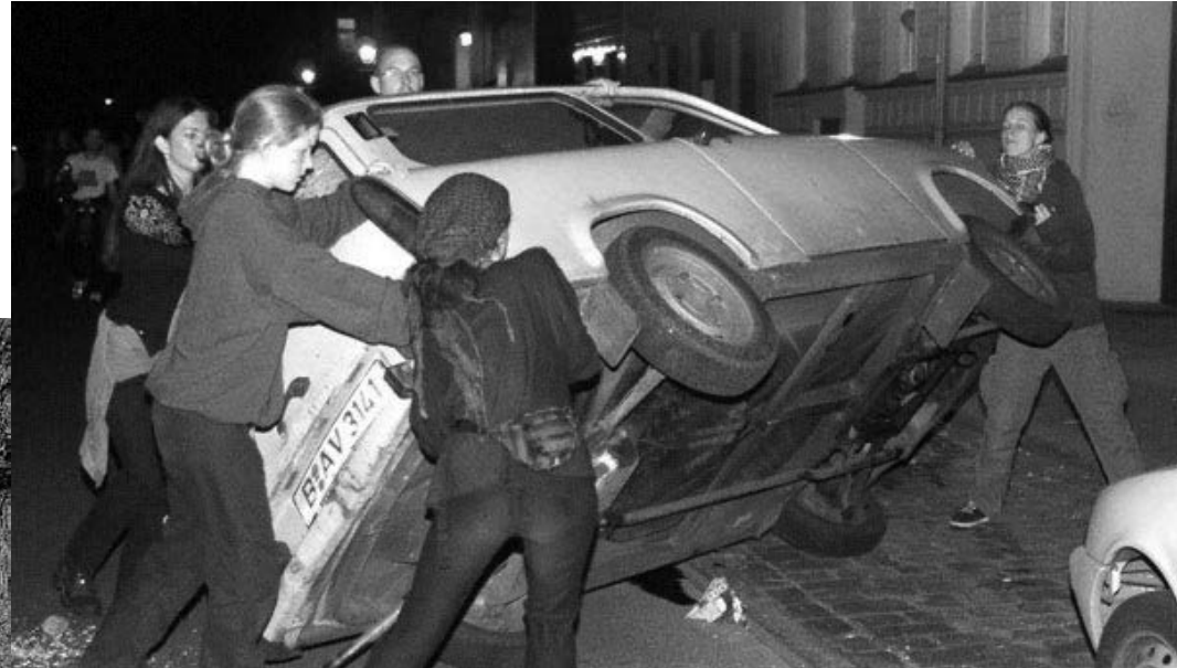
Demonstrators in Berlin on May Day, 2000.

On the afternoon of May 1, 1891, thousands of workers gathered in the plaza of Santa Croce in Rome to hear a series of speakers. A march of thousands more soon arrived, including members of the anarchist federation with red-trimmed banners. As the police chief noted, “The appearance of the Federazione Anarchica stimulated immediate excitement in the crowd.”