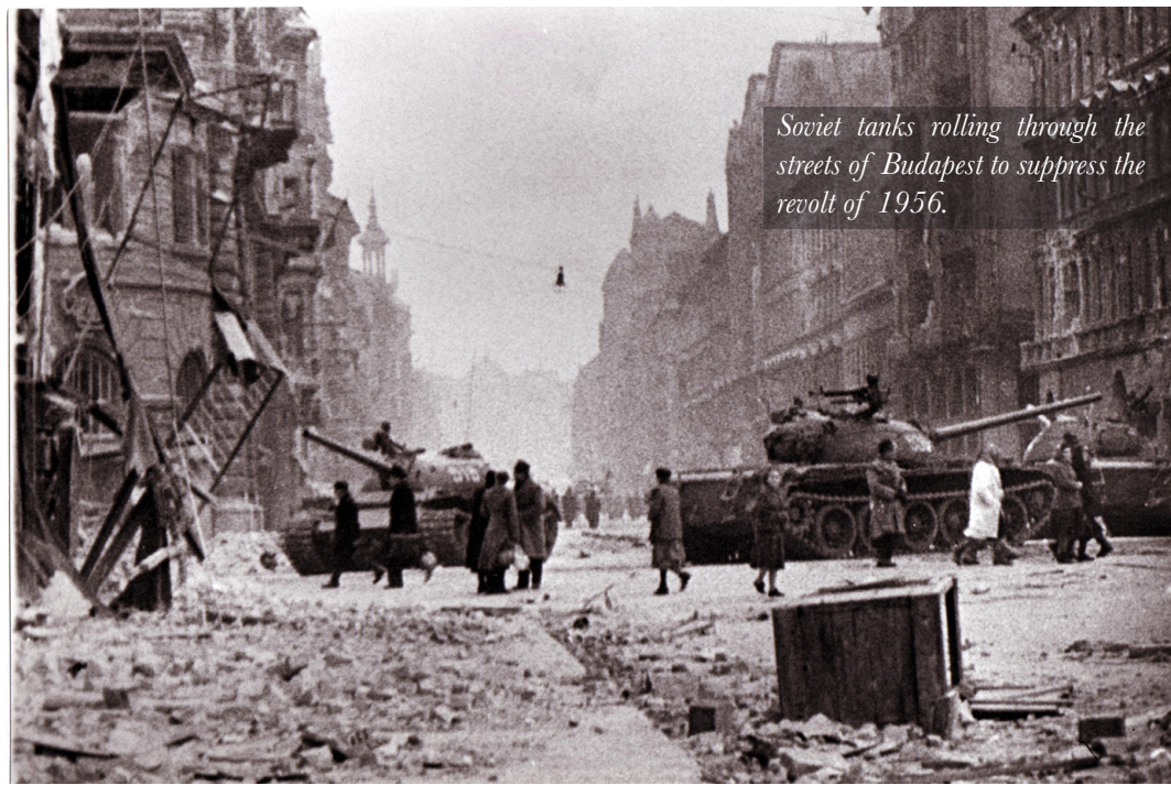
Soviet tanks rolling through the streets of Budapest to suppress the revolt of 1956.

Some have argued that we should suspend conflicts with proponents of authoritarian communism in order to focus on more immediate threats, such as fascism. Yet