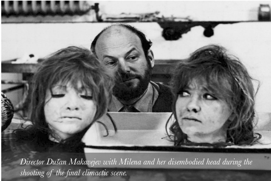
Director Dušan Makavejev with Milena and her disembodied head during the shooting of the final climactic scene.

We see Milena's disembodied head on an autopsy tray. As the camera zooms in past the forensic investigators, her head comes to life and addresses us, describing the outcome of her liaison with Vladimir Ilich, "a genuine Red Fascist."